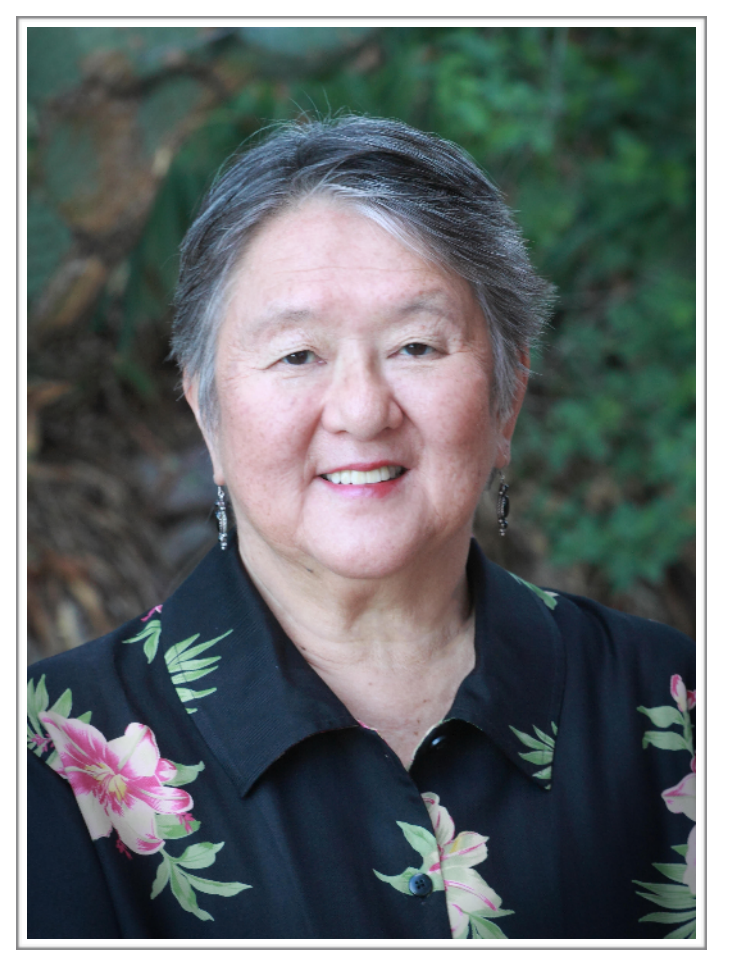
A Gathering of the Global Reiki Community

Lydgate Beach Park Wailua, Kauai, Hawaii Monday, November 25, 2019